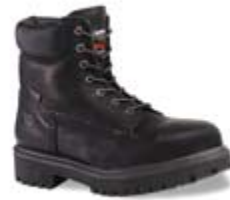
Model No. 26038