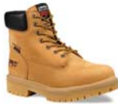
Model No. 65016 (In the Lehigh line)