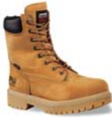
Model No. 26002